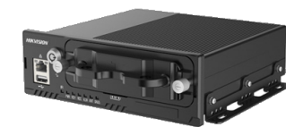
AE-MD5043 Mobile Video Recorder