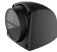
AE-VC224T-IT BSD (Blind Spot Detection) Camera