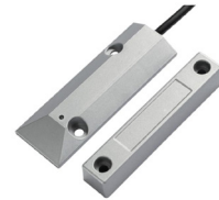
AE-MW6300 Door Status Sensor