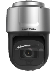
iDS-2VS445-F835H-MEY Illegal Parking Camera