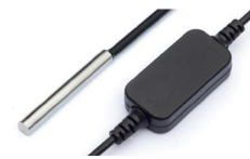
AE-MW6700 Temperature Sensor