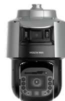
DS-2SF8C442MXS-DLW(14F1) TandemVu Camera