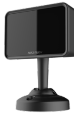
AE-VC154T-IT DBA (Driver Behavior Analysis) Camera