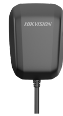
AE-VC155T ADAS (Advanced Driver Assistance System) Camera