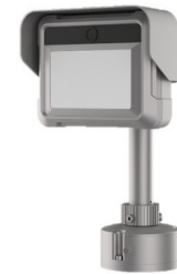
iDS-TCS402-B/CS/16 Speed Measurement Camera