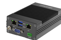
MV-VB2210-120G Vision Box