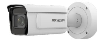
iDS-2CD7A46G0/P-IZHSY Dock Camera