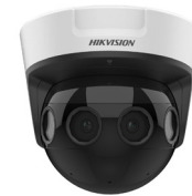
DS-2CD6944G0-IHS Panoramic Camera