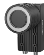
MV-ID6089M-00C-NNG Smart Code Reader