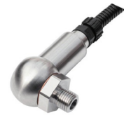
AE-MW6600 Fuel Level Sensor