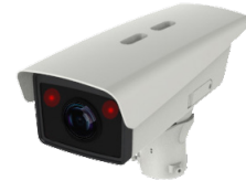
DS-TCG405-E ANPR Camera